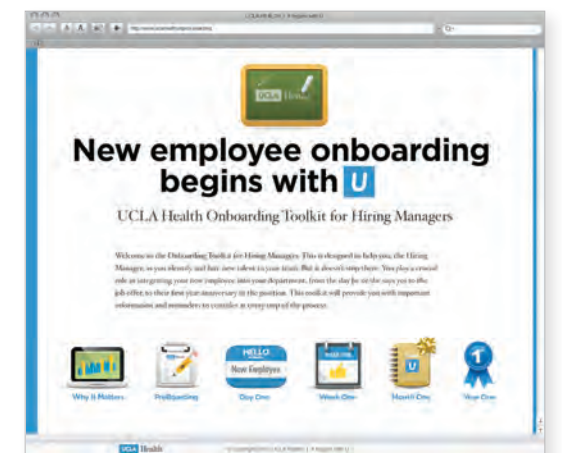
Employee Onboarding Toolkit Site