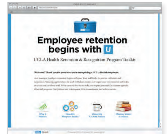
Retention & Recognition Program Site

Since the recent launch of both microsities and print companion pieces, response from managers across UCLA Health has been overwhelmingly positive. From ease of navigation, to clearer messaging, to the fact that all the necessary information is finally in one place on the portal, managers across UCLA Health now have a tool that better meets their needs. More than ever before, the organization is prepared to actively engage new employees from the day they’re hired, and then provide ongoing, personalized recognition, bringing about higher levels of employee retention and job satisfaction.