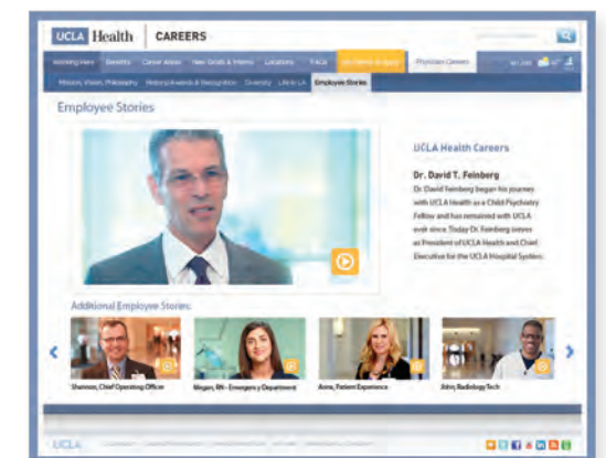
Cinematic videos featuring real employees, including the CEO, bring the UCLA story to life.