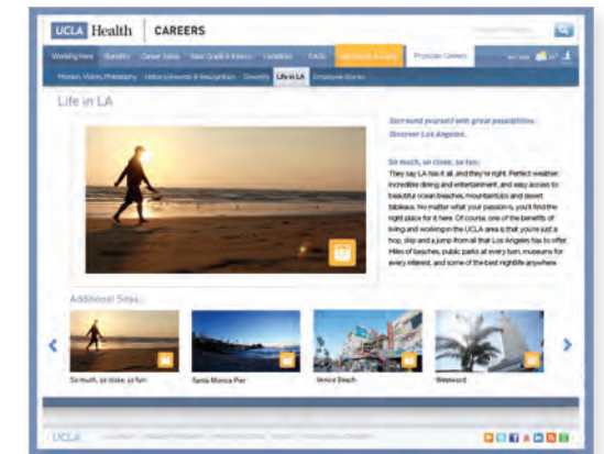
We brought the LA lifestyle front and center to attract candidates seeking diversity and excitement.

We successfully launched a Careers site that is a reflection of what UCLA Health is—a world-class institution with a team that’s committed to excellence. Since the launch of the “It begins with U” campaign, UCLA has been receiving over 50,000 applications annually. Our client has also seen a significant rise in qualified candidates and has achieved a near zero vacancy rate.